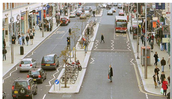
High Street Kensington 25,000 vehicles / day Two-way traffic on four lanes Easy to cross and spacious pavements Minimal highway clutter Attractive frontages

The comparison of these two locations highlights the importance of considering both urban form and connectivity, when determining how to make a town centre environment feel more pedestrian friendly.