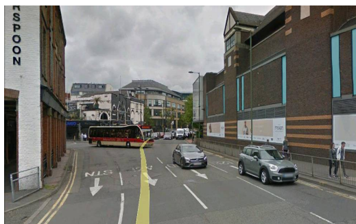
Guildford gyratory – Onslow Street 30,000 vehicles / day One-way traffic on four lanes Difficult to cross and narrow pavements Highway clutter (Many) unattractive frontages